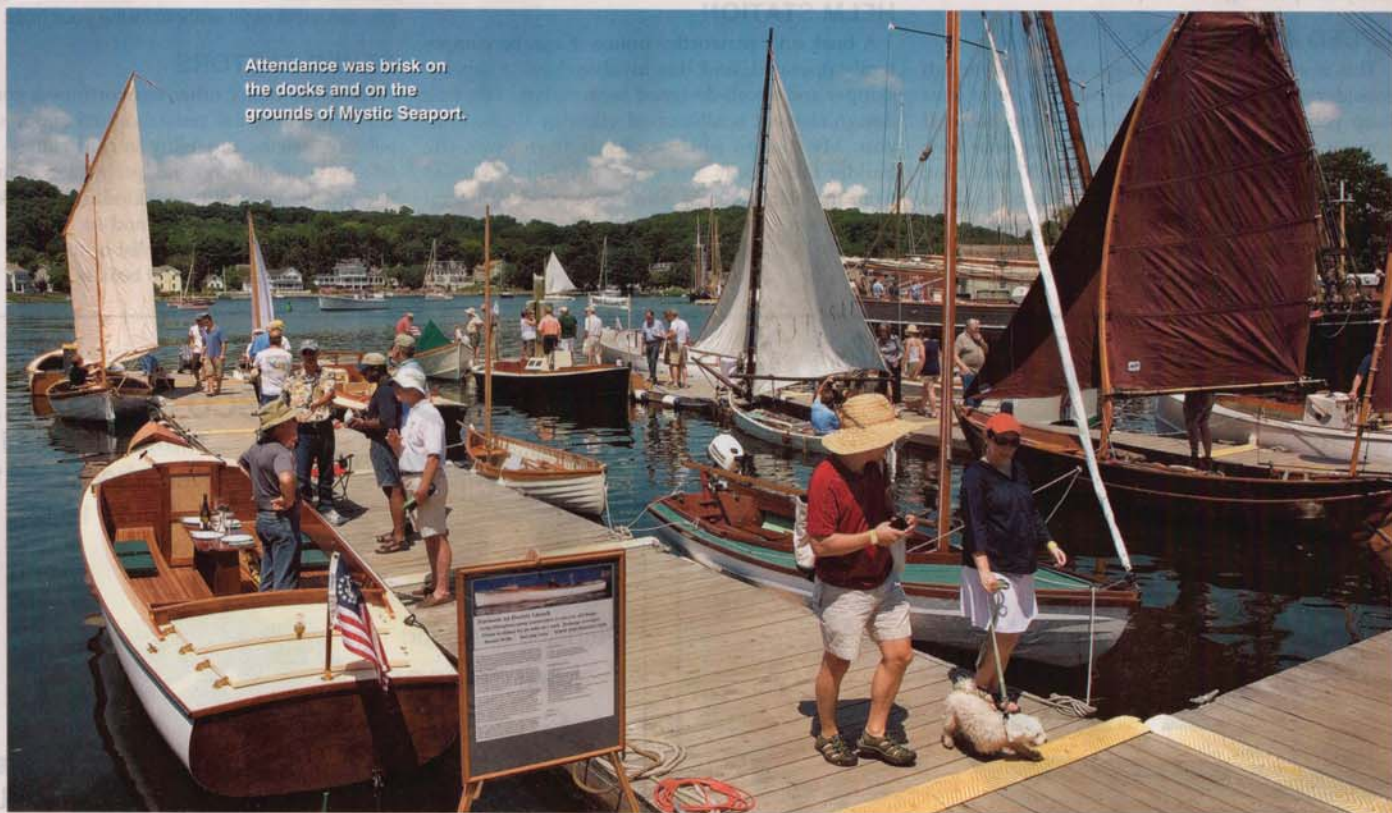
Attendance was brisk on the docks and on the grounds of Mystic Seaport.

The 18th annual WoodenBoat Show, in Mystic, Conn., offered up its ode to classic boatbuilding